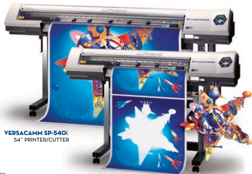
VERSACAMM SP-540i 54" PRINTER/CUTTER